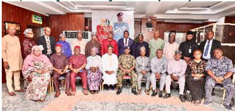
A Group Picture Of The JAMB Registrar, DG NYSC And Directors Of JAMB And NYSC

the integrity of the education system given the recent discoveries of unsavoury happenings by the Board. In addition, the two agencies expressed their resolve to adopt stronger measures to curb certificate forgery as well as thwart the efforts of dubious graduates, who are hell-bent on getting themselves mobilised for the national youth service.