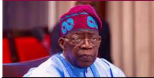
President of the Federal Republic of Nigeria, His Excellency, Senator Bola Ahmed Tinubu, GCFR.

The President of the Federal Republic of Nigeria, His Excellency, Senator Bola Ahmed Tinubu, has decried the alarming rate at which fake