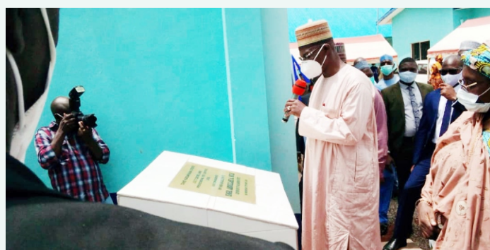
The Governor of Nasarawa State, Eng. Abdullahi Sule Commissioning the triple CBT Centres