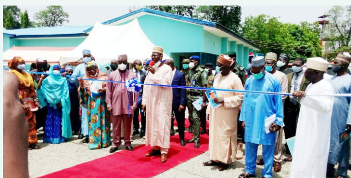
The Governor of Nasarawa state, Eng. Abdullahi Sule (middle) cutting the tape at the commissioning of the triple CBT centres.