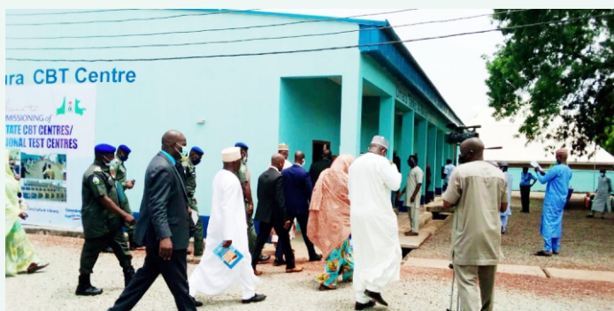
His Excellency, Eng. Abdullahi Sule, Officials of Nasarawa State Government and JAMB inspecting the commissioned CBT centres