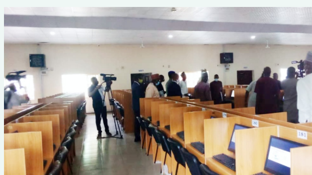
The Interior of one of the commissioned CBT centres