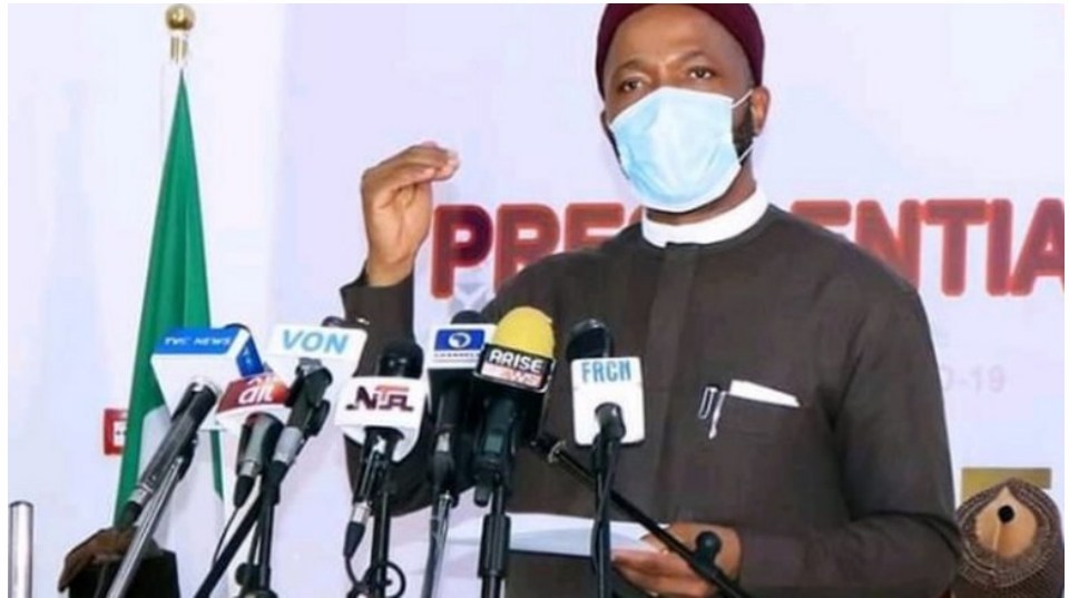
■ Hon. Chukwuemeka Nwajuiba, The Honourable Minister of State for Education.

...Rolls out Schedule for National Examinations