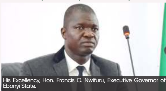
His Excellency, Hon. Francis O. Nwifuru, Executive Governor of Ebonyi State.

which have been of great benefit to the people of Ebonyi State and how best these processes could be accessed.