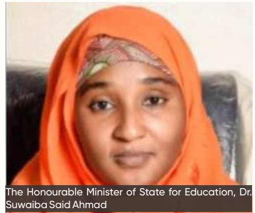
The Honourable Minister of State for Education, Dr. Suwaiba Said Ahmad

Dr. Morufu Olatunji Alausa hails from Epe, Lagos State. He is a medical doctor