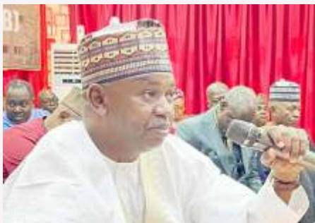
Senator Dandutse Muntari Muhammed, Chairman of the Senate Committee on Tertiary Institutions and TETFUND, giving his address during the Committee's oversight visit to the Board.

of the Senate Committee on Tertiary Institutions and TETFUND, during the committee's oversight visit to JAMB on Tuesday, November 5, 2024.