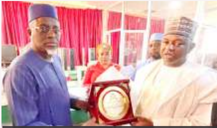
L-R: Prof. Is-haq Oloyede, Registrar JAMB, presenting a souvenir to Senator Dandutse Muntari Muhammed, Chairman of the Senate Committee on Tertiary Institutions and TETFUND, during the Committee's oversight visit to the Board.

Impressed by the achievements of Prof. Is-haq Oloyede, the Registrar of the Joint Admissions and Matriculation Board (JAMB), and his unwavering commitment to honesty and integrity, Senator Dandutse Muntari Muhammed, Chairman of the Senate Committee on Tertiary Institutions and TETFUND, has hailed Oloyede as a true asset to