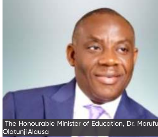
The Honourable Minister of Education, Dr. Morufu Olatunji Alausa