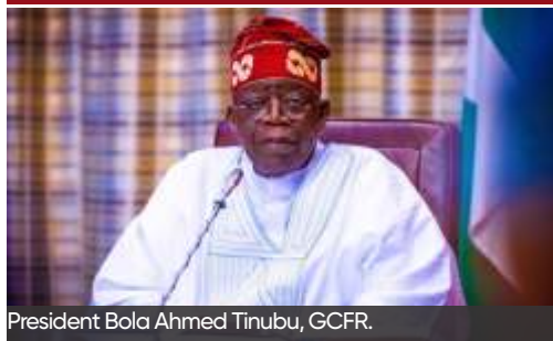
President Bola Ahmed Tinubu, GCFR.