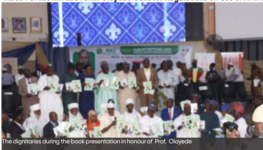
The dignitaries during the book presentation in honour of Prof. Oloyede

quest to seek solution about their subjects so as not to be misled.