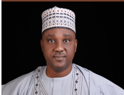
Rt. Hon. Tajudeen Abbas, Speaker House of Representatives

Abbas, will officially open the inaugural Africa Regional Conference on Equal Opportunity of Access to Higher Education (ARCEAHED) on Tuesday, September 17, 2024, in Abuja.