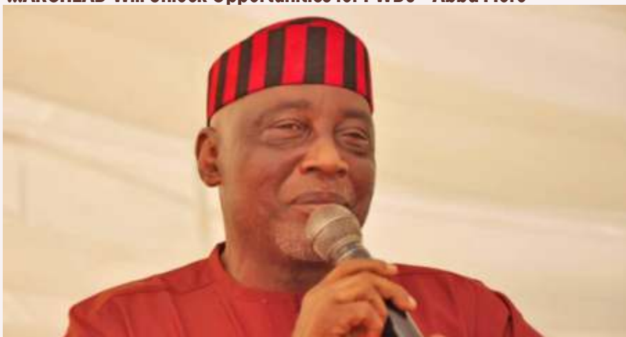
Senator Abba Moro

this at the just-concluded ARCHEAD held in Abuja, pointed out that the conference was a crucial step towards achieving collective goal of inclusivity and empowerment for persons with disabilities. He stated that the theme: "Advancing the Potentials of Persons with Disabilities in Education and Economic Development" captured the essence of the conference which, among other things, is to explore,