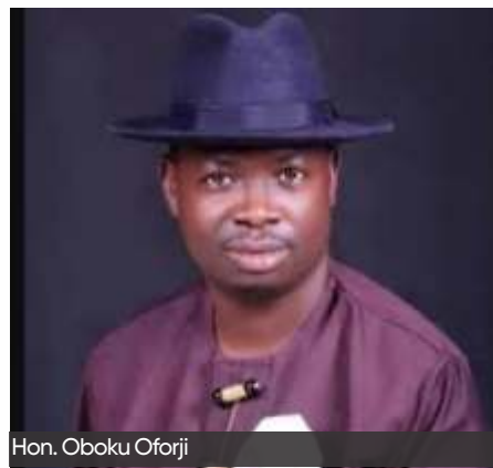
Hon. Oboku Oforji

National Commission for Persons with Disabilities which principal mandate is to liaise with the public and private sector and other bodies to ensure that the peculiar interests of disabled persons are taken into consideration in every government policy, programmes and activity."