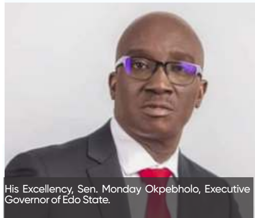
His Excellency, Sen. Monday Okpebholo, Executive Governor of Edo State.

The Benin Zonal Office of the Joint Admissions and Matriculation Board (JAMB) has joined other compatriots in Edo State to celebrate the 2025 Children's Day. This year's theme which was: "Stand Up, Speak Up: Building a Bullying-Free Generation", was presided over by the Edo State Governor, Senator Monday Okpebholo.