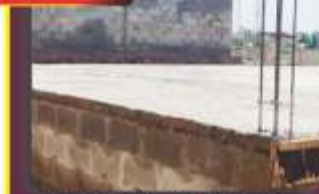
PROPERTY TYPE 3

DEVELOPMENT UP TO DAMP PROOF COURSE (450sqm) ₦7,500,000.00