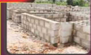
PROPERTY TYPE 4

DEVELOPMENT UP TO FOUNDATION (450sqm) ₦6,000,000.00