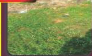
PROPERTY TYPE 5

PLOT OF LAND RIPE FOR DEVELOPMENT (450sqm) ₦3,500,000.00