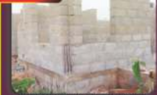
PROPERTY TYPE 1

DEVELOPMENT UP TO LINTEL LEVEL (450sqm) ₦10,500,000.00