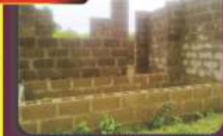
PROPERTY TYPE 2

DEVELOPMENT UP TO WINDOW LEVEL (450sqm) ₦9,500,000.00