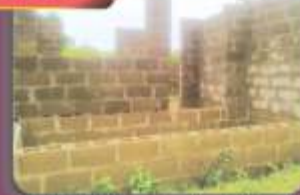
PROPERTY TYPE 2

DEVELOPMENT UP TO WINDOW LEVEL (450sqm) ₦9,500,000.00