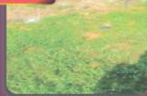
PROPERTY TYPE 5

PLOT OF LAND RIPE FOR DEVELOPMENT (450sqm) ₦3,500,000.00