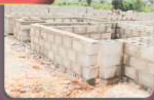
PROPERTY TYPE 4

DEVELOPMENT UP TO FOUNDATION (450sqm) ₦6,000,000.00