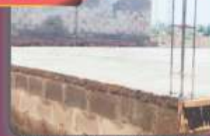
PROPERTY TYPE 3

DEVELOPMENT UP TO DAMP PROOF COURSE (450sqm) ₦7,500,000.00