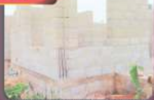
PROPERTY TYPE 1

DEVELOPMENT UP TO LINTEL LEVEL (450sqm) ₦10,500,000.00