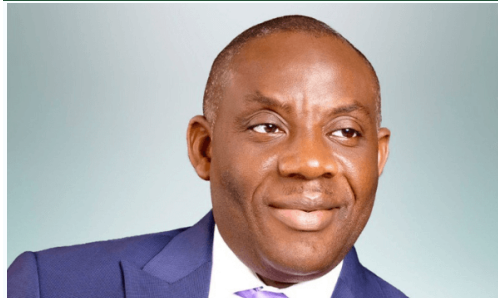
Hon. Minister of Education, Dr Maruf Tunji Alausa

The Federal Government has assured Nigerians that the recurring industrial actions by the Academic Staff Union of Universities (ASUU) have now become a thing of the past.