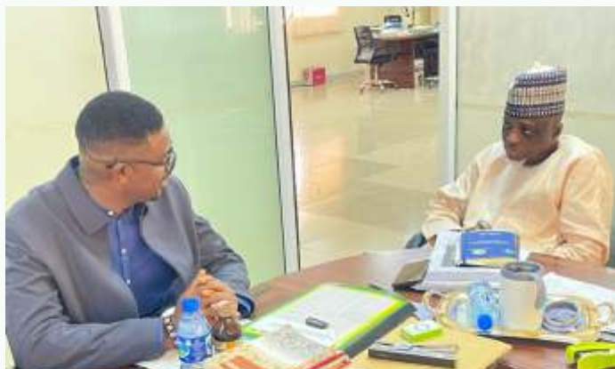
The Deputy Minister of Education, Sierra Leone, Minister, Mr Sirjoh Aziz Kamara with the Registra of JAMB, Prof Is-haq Oloyede