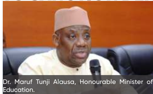
Dr. Maruf Tunji Alausa, Honourable Minister of Education.

of honorary degrees from affixing the "Dr" title to their names.