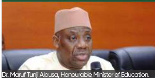
Dr. Maruf Tunji Alausa, Honourable Minister of Education.

The Minister of Education, Dr. Maruf Tunji Alausa, has warned that stiffer sanctions awaits tertiary institutions, which flagrantly abused the nation's admission process and the Central Admission Processing System (CAPS), an automated platform for the