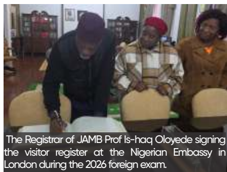
The Registrar of JAMB Prof Is-haq Oloyede signing the visitor register at the Nigerian Embassy in London during the 2026 foreign exam.

Officials of the Board were deployed to the various foreign centres to monitor and supervise the conduct of the examination.