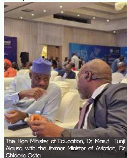
The Hon Minister of Education, Dr Maruf Tunji Alausa with the former Minister of Aviation, Dr Chidoka Osita