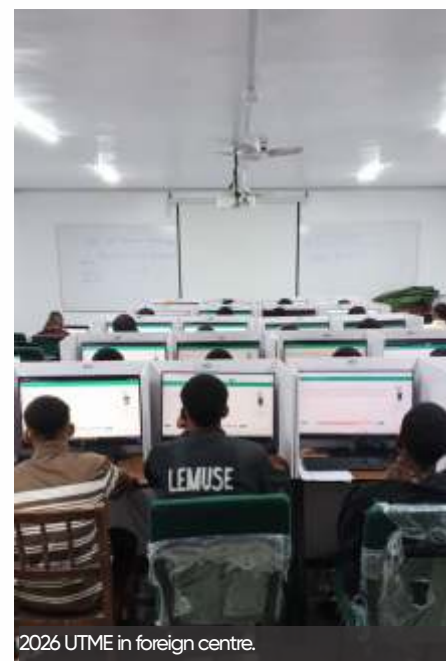
2026 UTME in foreign centre.