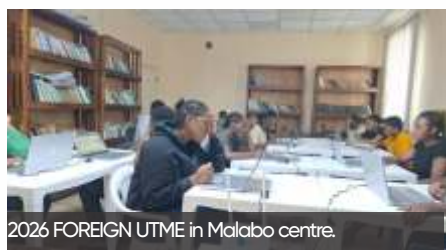
2026 FOREIGN UTME in Malabo centre.