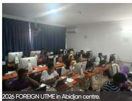
2026 FOREIGN UTME in Abicjan centre.