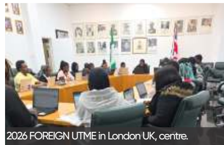
2026 FOREIGN UTME in London UK, centre.