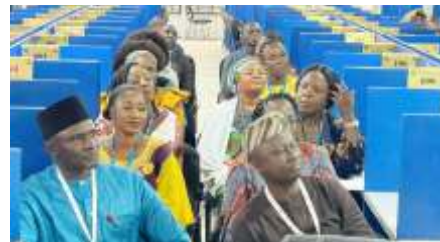
Participants at the TA workshop.