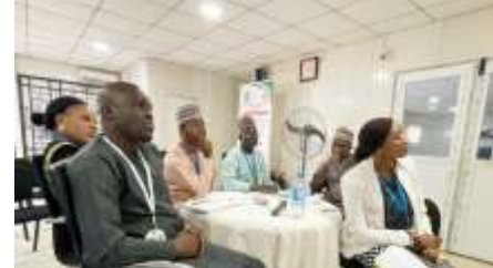
Some of the participants at the workshop.