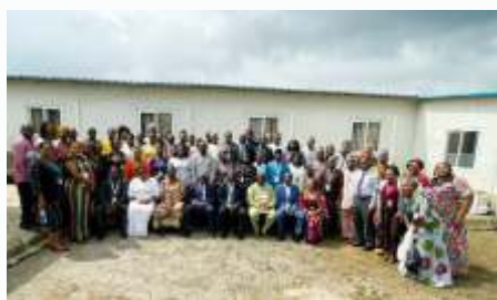
A cross section of participants at the workshop.

A s part of its avowed commitment to rejig its Test Administration Department for better performance, the Joint Admissions and Matriculation Board (JAMB) recently organised a Retreat on capacity building and skills development titled: "Activities of the Test Administration Department in the Information Technology Era: Challenges and Prospects" at the Board's Professional Test Centre (PTC), Kogo, Bwari, Abuja.