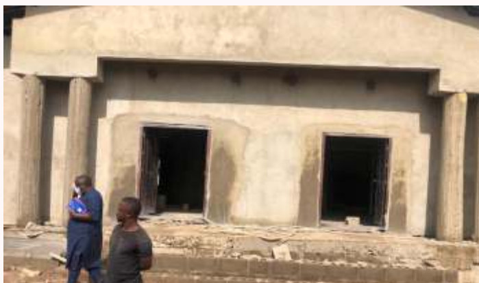
NEW AKURE OFFICE UNDER CONSTRUCTION IN CONJUNCTION WITH NCC