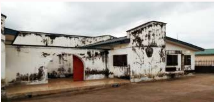
OLD KOGI OFFICE