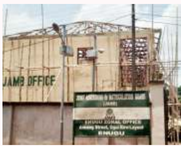
ON GOING REMODELLING OF ENUGU ZONAL OFFICE