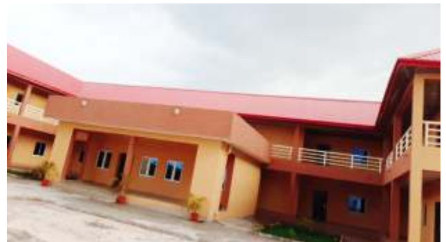
NEW STATE OFFICE BENIN