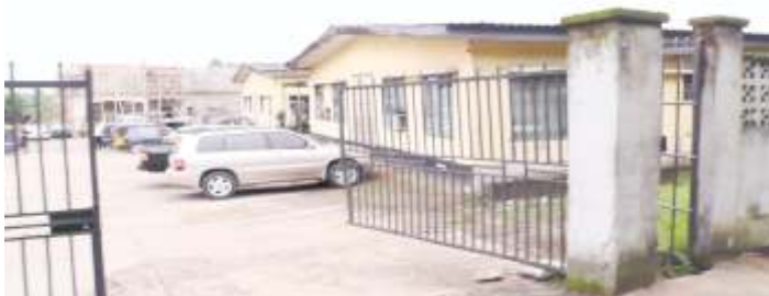
OLD CALABAR OFFICE