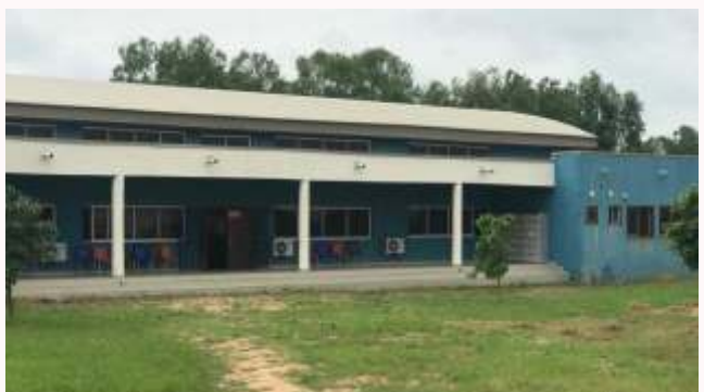
NEW KANO ZONAL OFFICE BUILT