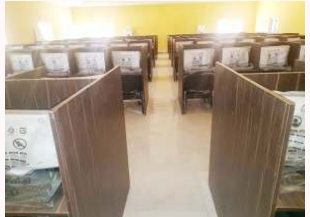
NEW KEBBI CBT CENTRE