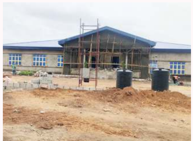
ONGOING CONSTRUCTION OF MEGA CENTRE IN KOGI IN CONJUNCTION WITH NCC