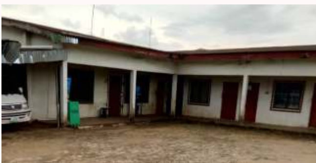
OLD OWERRI OFFICE