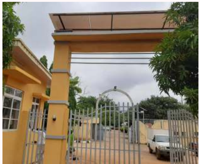
REMODELED GATE OF OLD KADUNA ZONAL OFFICE