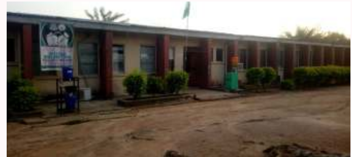
OLD OSOGBO OFFICE