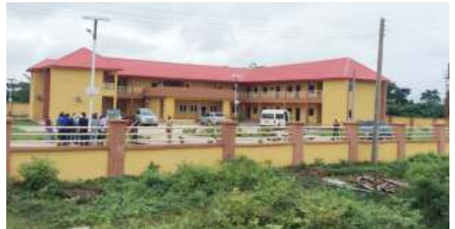
NEW BENIN OFFICE