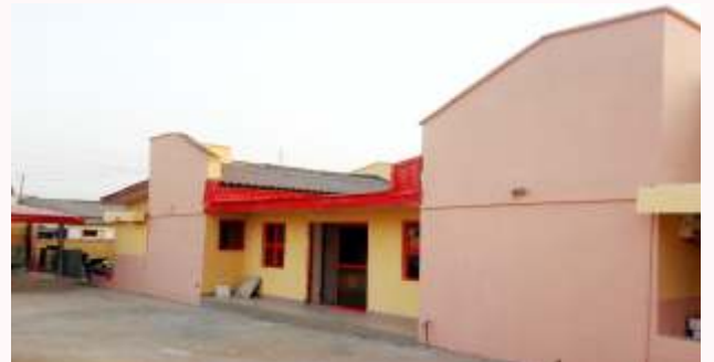
NEW KOGI OFFICE