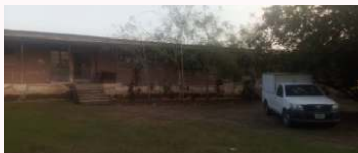
OLD ABEOKUTA OFFICE