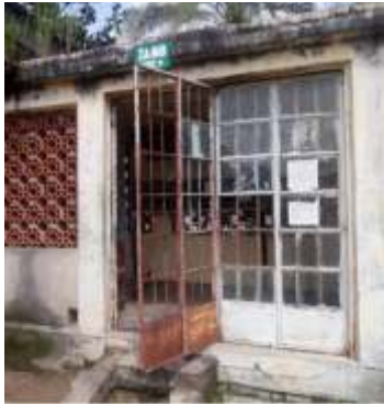
OLD ZONAL OFFICE BAUCHI