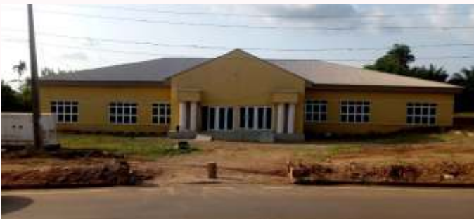
NEW OSOGBO OFFICE BUILT IN CONJUNCTION WITH NCC