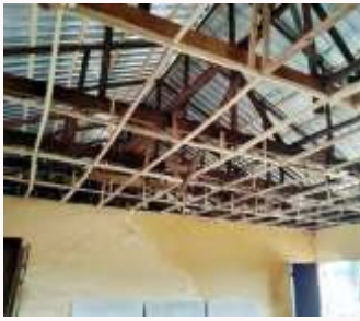
OLD ENUGU ZONAL OFFICE