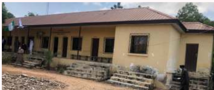
OLD ADAMAWA STATE OFFICE YOLA