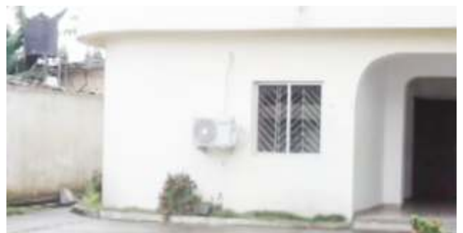
NEW CALABAR OFFICE