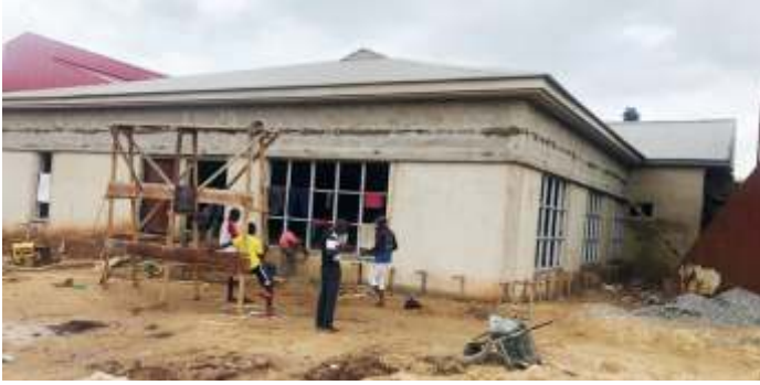
NEW AWKA OFFICE UNDER CONSTRUCTION IN CONJUNCTION WITH NCC