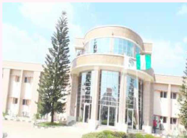
OLD AND NEW JAMB NATIONAL HEADQUARTERS, BWARI, ABUJA