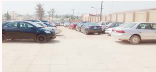
NEW PARKING LOT AT THE HEADQUARTERS