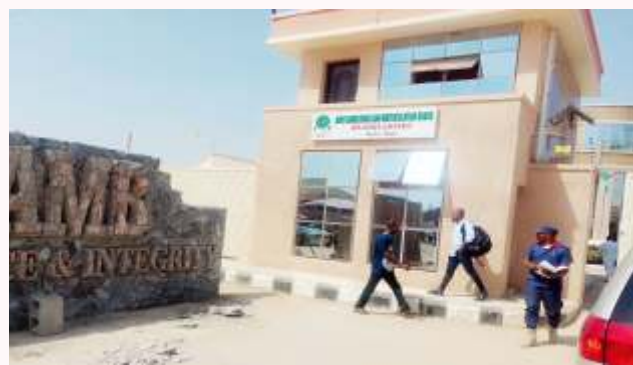
NEW GATE HOUSE AT THE HEADQUARTERS