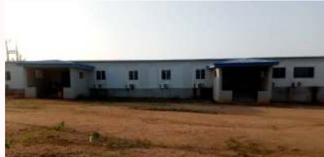
SECOND NEW OSOGBO OFFICE