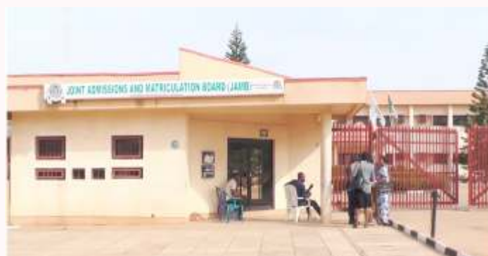
OLD GATE HOUSE AT THE HEADQUARTERS