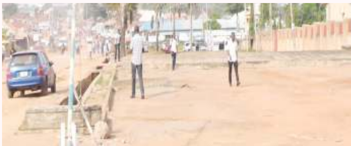
OLD PARKING LOT AT THE HEADQUARTERS