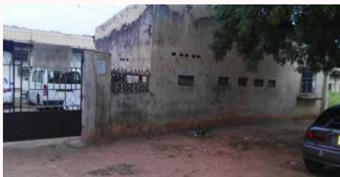
OLD KANO ZONAL OFFICE