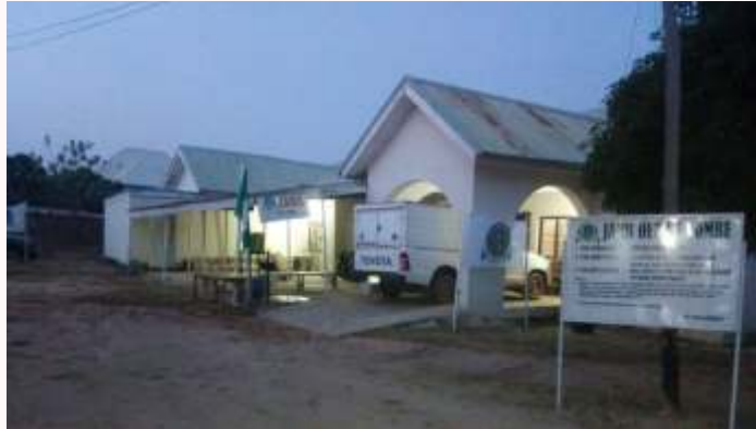
OLD GOMBE STATE OFFICE