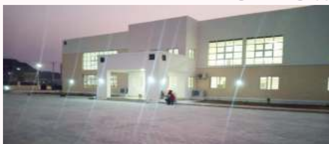
NEW OWERRI OFFICE