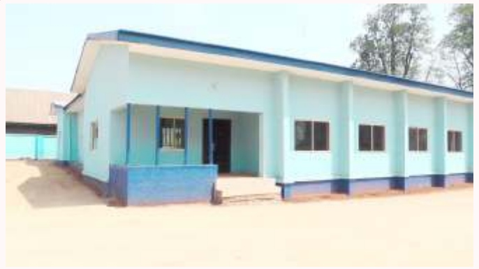
NEW LAFIA OFFICE