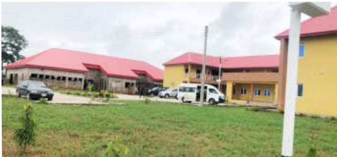
NEW BENIN OFFICE AND ONGOING MEGA CBT CENTRE