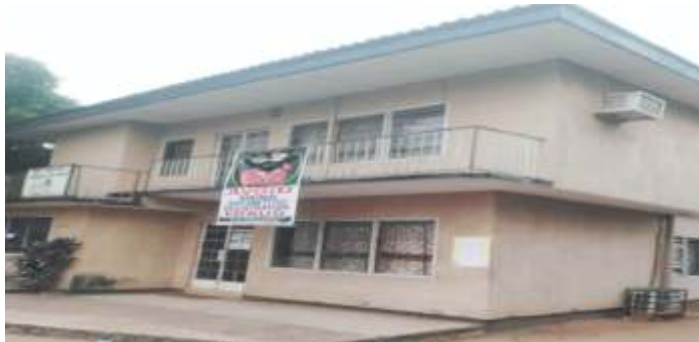
OLD BENIN OFFICE