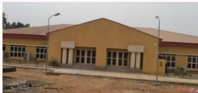
NEW ABEOKUTA OFFICE BUILT IN CONJUNCTION WITH NCC