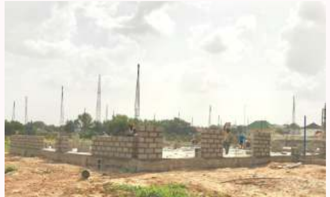
NEW GOMBE OFFICE UNDER CONSTRUCTION IN CONJUNCTION WITH NCC