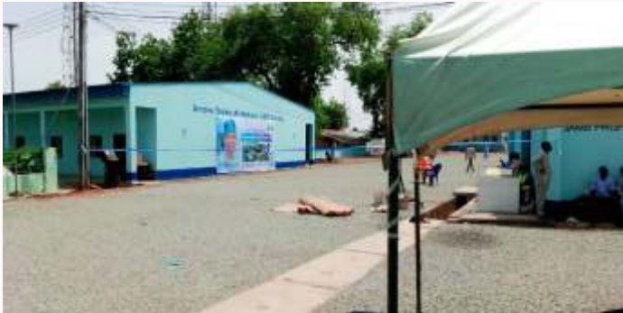
SECOND NEW NASARAWA OFFICE