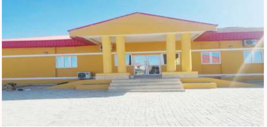
NEW KEBBI OFFICE IN CONJUNCTION WITH NCC