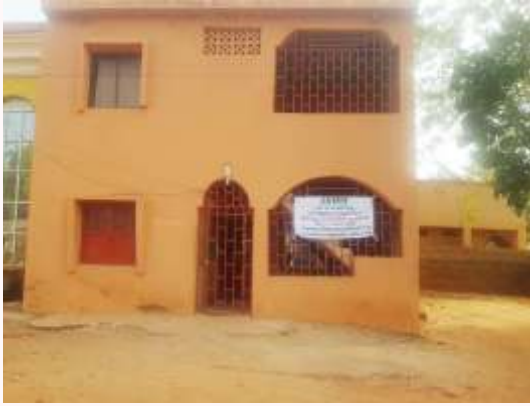
OLD KEBBI OFFICE