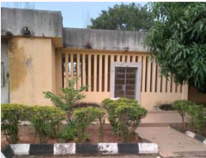
OLD KADUNA ZONAL OFFICE