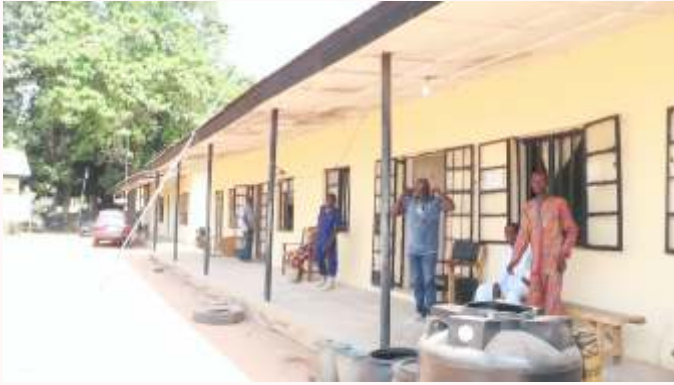
OLD LAFIA OFFICE