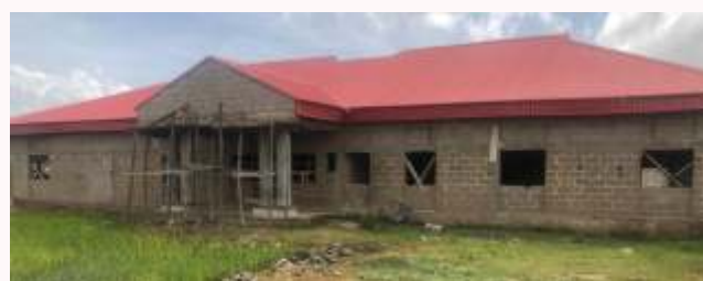
NEW ADAMAWA STATE OFFICE YOLA UNDER CONSTRUCTION IN CONJUNCTION WITH NCC