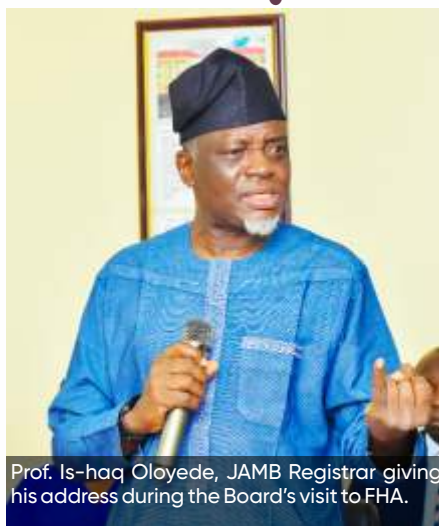
Prof. Is-haq Oloyede, JAMB Registrar giving his address during the Board's visit to FHA.

The Registrar, while commending the management of FHA, led by Distinguished Sen. Gbenga Ashafa, reiterated the importance of affordable housing for the staff as it impacts positively on the efficiency of labour and productivity. According to the Registrar, the Board is statutorily empowered to serve the nation through its mandate noting that while discharging its obligations to the nation, there is also a need to cater for the welfare of its workers, who toil day and night to ensure that the Board deliver on its mandate. He, therefore, stated that it is incumbent on the Board to prioritise the welfare of its staff within what the law allows.