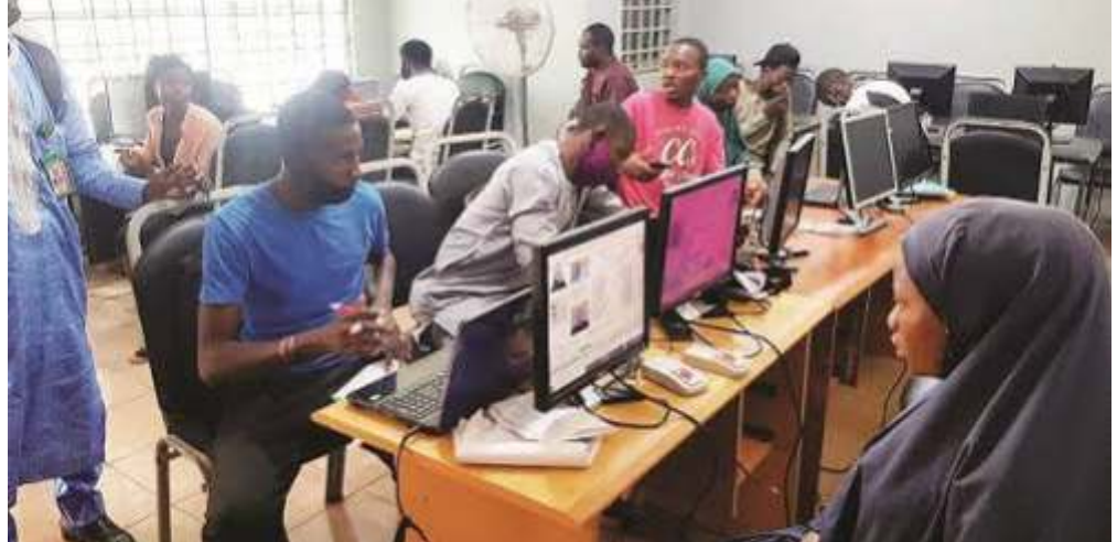
A JAMB Professional Registration Centre (PRC).

All candidates who registered for the Unified Tertiary Matriculation Examination (UTME) and Direct Entry (DE) but who have not linked their e-mail addresses with their profiles, are urged to visit any Board's approved CBT centres to do so without delay. The process is entirely free. It should be recalled that during the 2022 UTME/DE Registration Exercise, the Board stopped candidates from linking their email addresses to the registration portal. The