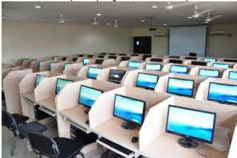
JAMB Accredited Professional Testing Centre.

for the e-PIN as subsidised by the Federal Government, N500 for the compulsory reading text which is paid to the publisher, and N700 regulated service charge for CBT centres, which candidates