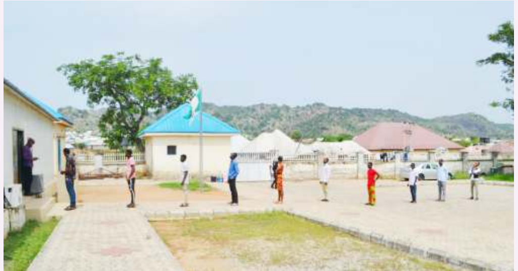
Candidates queuing to register at a Professional Registration Centre (PRC) while observing social distancing.

In its bid to leverage the digital competence of its increasing number of computer-savvy candidates, the Joint Admissions and Matriculation Board (JAMB) is introducing self-registration outlets in Abuja and Lagos. This system would, in the long run, reduce the crowds at CBT centres in these cities. The conception of this noble idea is to, besides