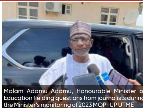
Malam Adamu Adamu, Honourable Minister of Education fielding questions from journalists during the Minister's monitoring of 2023 MOP-UP UTME

T he Hon. Minister of Education, Malam Adamu Adamu, has commended the efforts of the