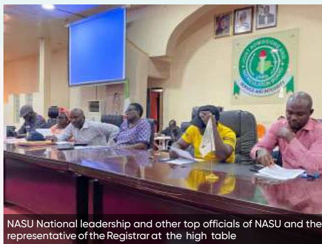
NASU National leadership and other top officials of NASU and the representative of the Registrar at the high table