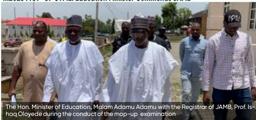
The Hon. Minister of Education, Malam Adamu Adamu with the Registrar of JAMB, Prof. Is-haq Oloyede during the conduct of the mop-up examination

that all candidates, who had indicated interest in sitting the examination, are accommodated as adequate arrangements had been made to cater for any challenges.