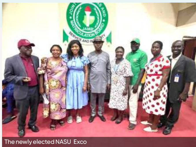
The newly elected NASU Exco