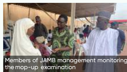
Members of JAMB management monitoring the mop-up examination