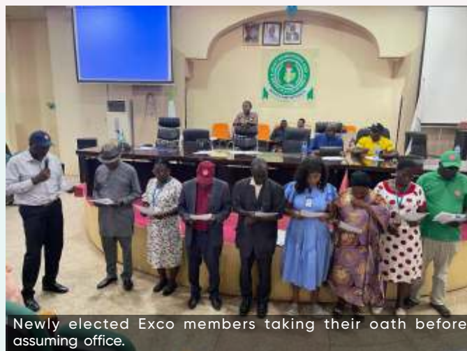
Newly elected Exco members taking their oath before assuming office.