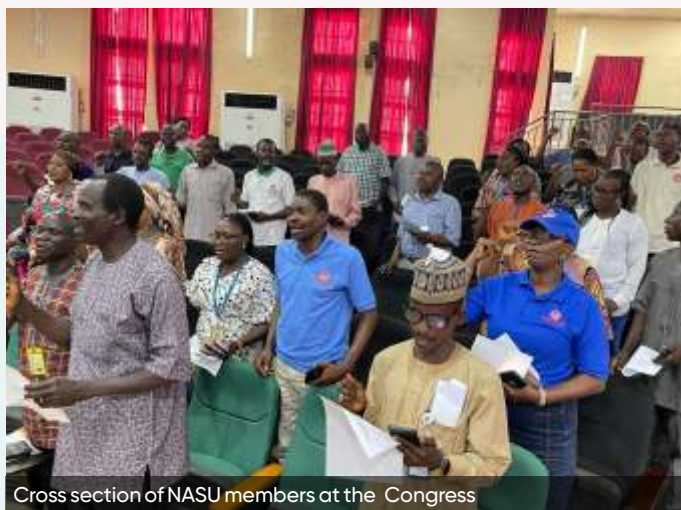
Cross section of NASU members at the Congress