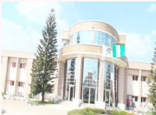
JAMB National Headquarters, Bwari-Abuja.

T he Joint Admissions and Matriculation Board has won the 2021 Best Ministerial SERVICOM Unit(MSU)Team C Award.