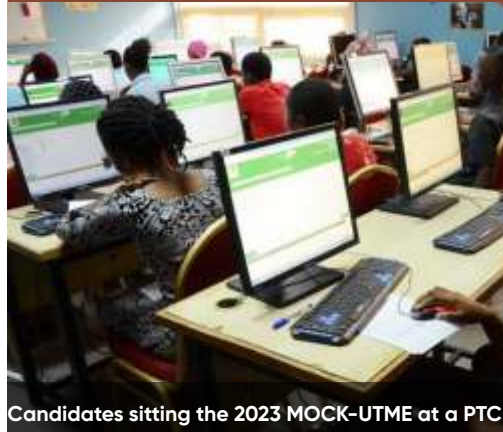
Candidates sitting the 2023 MOCK-UTME at a PTC

some technical hitches in some centres thereby denying some candidates the opportunity to sit the examination.