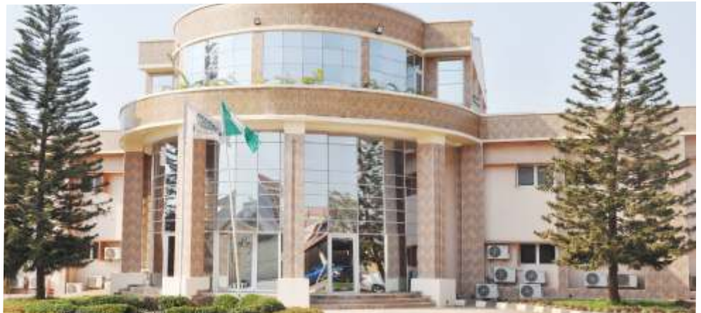
JAMB National Headquarters, Abuja.