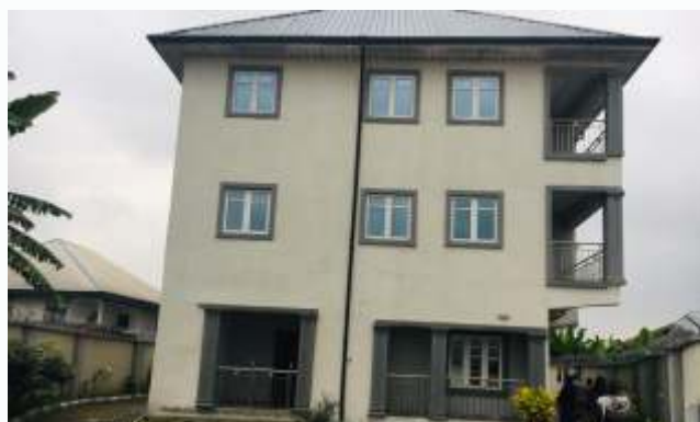
The new Akwa Ibom State Office complex donated by the State Government.