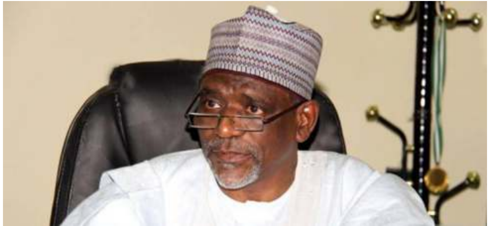
Honourable Minister of Education, Mall. Adamu Adamu

The Hon. Minister of Education, Mall. Adamu Adamu, has reiterated the commitment of the Federal Ministry of Education (FME) to take the education sector to greater heights.