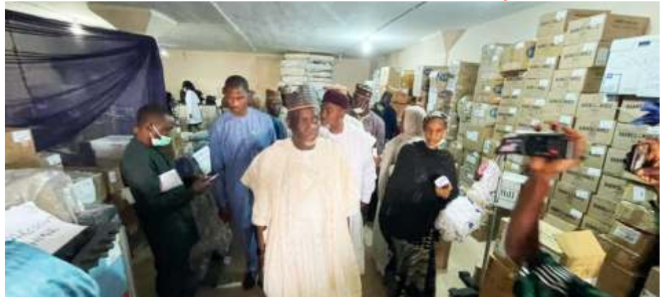
The Registrar, JAMB, Prof Is-haq Oloyede, examining the PROJECT CURE donated medical equipment delivered to University of Ilorin Teaching Hospital along with other dignitaries.

...Intervention a Boon to the Health Sector - Oloyede