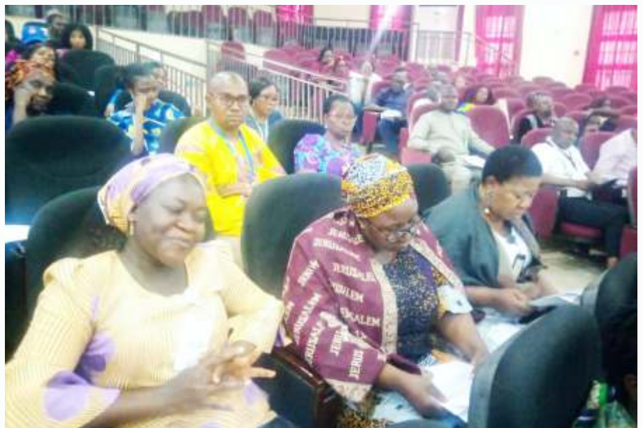
Cross section of NASU members at the meeting.