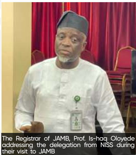
The Registrar of JAMB, Prof. Is-haq Oloyede addressing the delegation from NISS during their visit to JAMB

Oloyede expressed appreciation to the leadership of the Institute for the visit stressing that the relationship between the two agencies of government was crucial for national development.