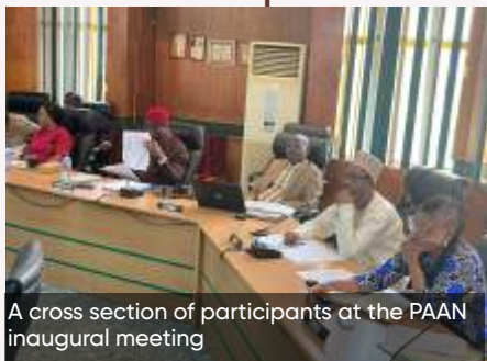
A cross section of participants at the PAAN inaugural meeting

adopted at a meeting of strategic agencies and professional bodies/associations, called to discuss modalities for the establishment of the much-awaited Academy.