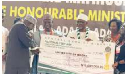
University of Ibadan, Ibadan, Oyo State, receiving the runner-up award for the Most Compliant Institution in keeping to the Guidelines in 2020 Admission.