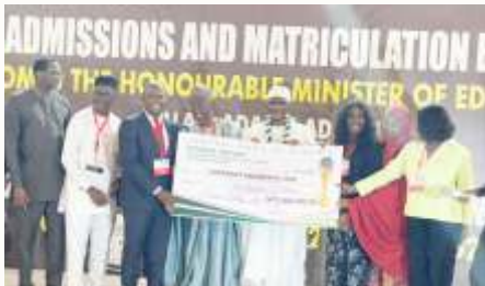
Covenant University, Ota, Ogun State, receiving the award for the Most Compliant Institution in keeping to the Guidelines in 2020 Admission.