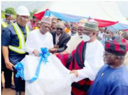
The Hon. Minister, Mal. Adamu Adamu (with face mask) at the foundation laying ceremony of FUHSO

The President of the Federal Republic of Nigeria, President Muhammadu Buhari, GCFR has performed the groundbreaking and foundation-laying ceremony of the Federal University of Health Sciences (FUHSO), Akwete-Akpa, Otukpo on Monday, 18th July, 2022, he was represented by the Honourable Minister of Education, Malam Adamu Adamu. In a related development, the Honourable Minister of Education also used the occasion to unveil JAMB-facilitated medical equipment donated to the institution courtesy of Project C.U.R.E. (USA) for effective medical training and healthcare services.