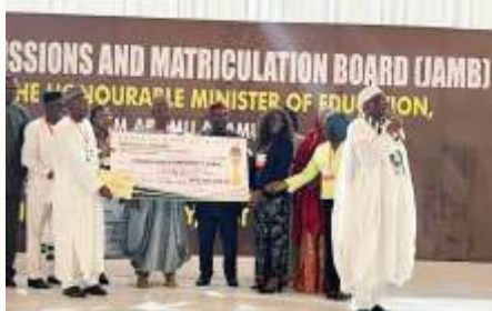
Ahmadu Bello University, Zaria, Kaduna State, receiving the award for the Institution with the Highest Number of International Students in 2020 Admissions.