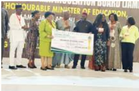
University of Ilorin, Kwara State, receiving the award for the 2020 Institution of First Choice for Candidates to Tertiary Institutions in Nigeria.