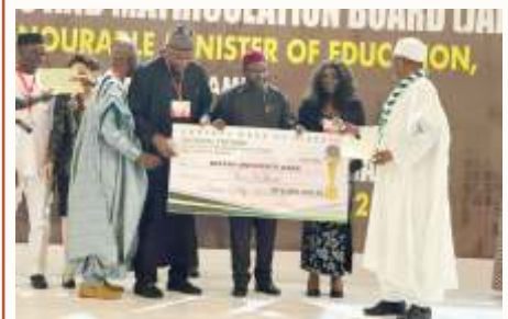
Bayero University, Kano, Kano State, receiving the 2nd runner-up award for the 2020 Institution of First Choice for Candidates to Tertiary Institutions in Nigeria.