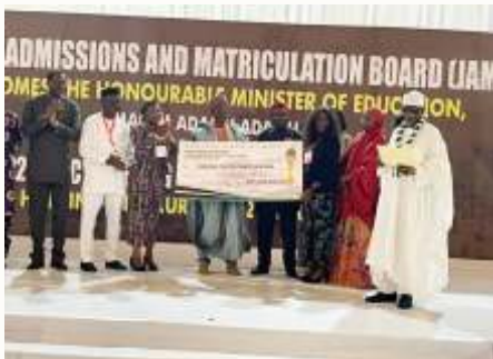
Kaduna Polytechnic, Kaduna, Kaduna State, receiving the award for the Most National Institution in 2020 Admissions.