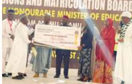
University of Maiduguri, Maiduguri, Borno State, receiving the runner-up award the Institution with the Highest Number of International Students in 2020 Admissions.