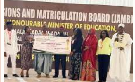
Nile University of Nigeria, FCT, Abuja, receiving the 2nd runner-up award for the Institution with the Highest Number of International Students in 2020 Admissions.