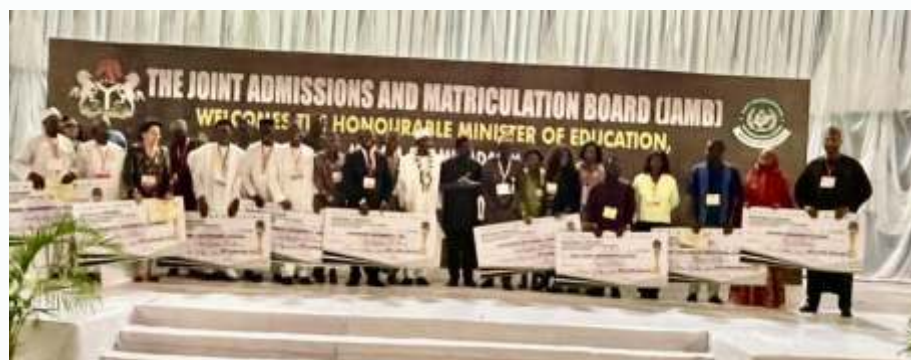
The recipients in a group photograph.

Speaking further, he said the next edition would be a mega award as the overall prize would be increased to 750 million naira as against the 500 million naira distributed in the 2020 Edition.