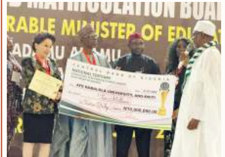
Afe babalola University, Ado-Ekiti, Ekiti State, receiving the 2nd runner-up award for the Most National Institution in 2020 Admissions.