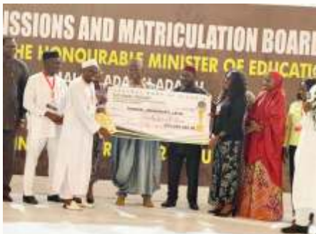
Federal University, Lafia, Nasarawa State, receiving the award for the 2020 Most Improved Institution in Gender Balance.