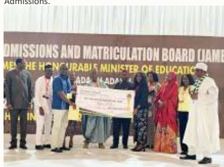
FCT College of Education, Zuba, FCT, Abuja, receiving the runner-up award for the 2020 Most Improved Institution in Gender Balance.