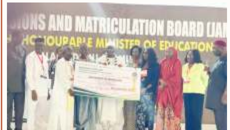
University of Maiduguri, Maiduguri, Borno State, receiving the 2nd runner-up award for the Most Compliant Institution in keeping to the Guidelines in 2020 Admission.