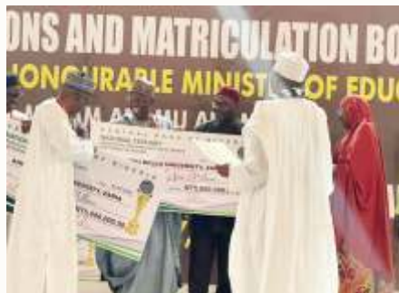
Ahmadu Bello University, Zaria, Kaduna State, receiving the runner-up award for the Most National Institution in 2020 Admissions.