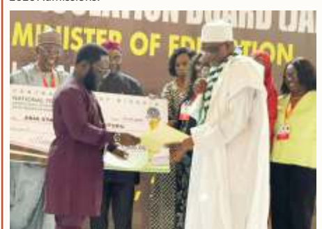
Abia State University, Uturu, Abia State, receiving the 2nd runner-up award for the 2020 Most Improved Institution in Gender Balance.