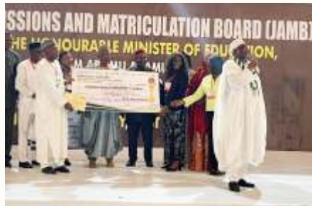
Ahmadu Bello University, Zaria, Kaduna State, receiving the runner-up award for the 2020 Institution of First Choice for Candidates to Tertiary Institutions in Nigeria.