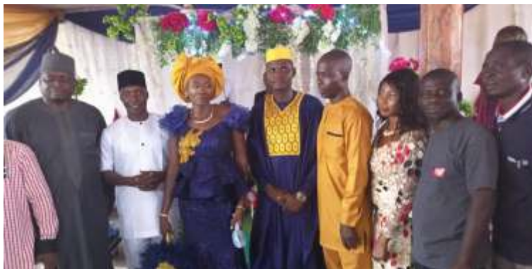
The Couple (in the middle) in a group photograph with some staff of the Makurdi State Office at the Wedding ceremony.