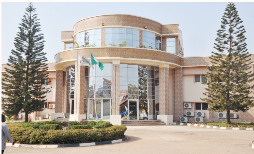
Joint Admissions and Matriculation Board, National Headquarters.

A head of the 2021 Unified Tertiary Matriculation Examination (UTME) and Direct Entry registration exercise, the Joint Admissions and Matriculation Board (JAMB) has conducted a centre accreditation and validation exercise against the backdrop of fresh guidelines for the operations of the Computer-Based Test (CBT) centres to be used for the forthcoming registration and examination. The fresh guidelines issued at a virtual meeting with the Chief Technical Advisors (CTAs) from the 36 States of the Federation and FCT on Tuesday, 15th February, 2021,